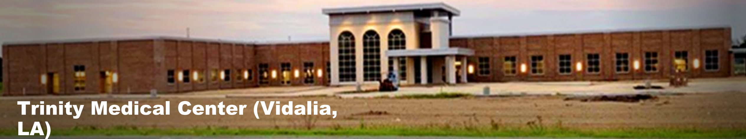
Trinity Medical Center (Vidalia, LA)