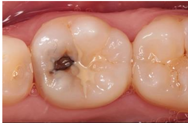
#2 EVALUATE CARIES REQUIRING RESTORATIONS