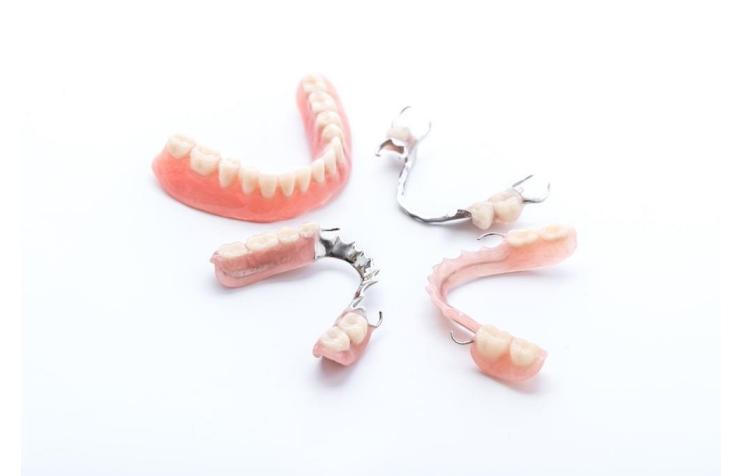
#3 REPLACEMENT OPTIONS